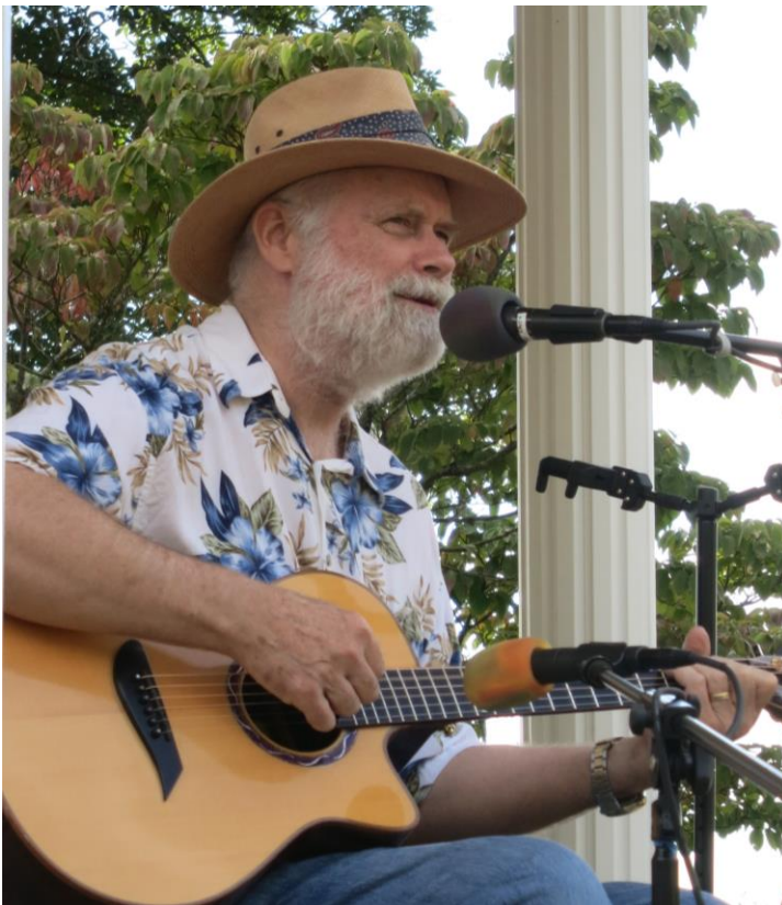
2015 Gazebo Concert